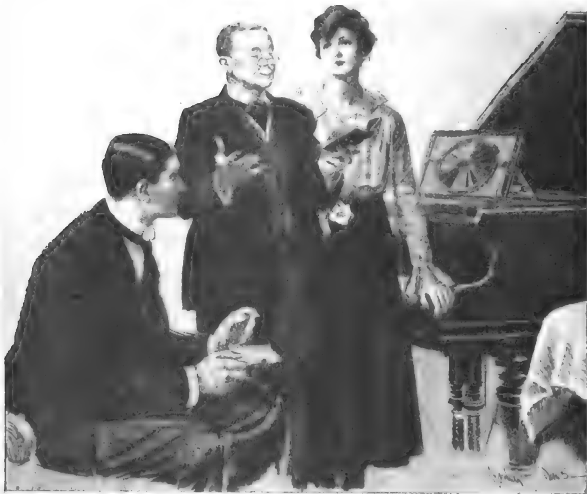
"THIS IS A MOST EXTRAORDINARY THING. THIS IS THE IDENTICAL BANK-NOTE THAT

the Red Cross envelope this afternoon as my Christmas gift, the very same that I got for the purpose of sending anonymously, and that you ladies were interested to inspect at breakfast time."