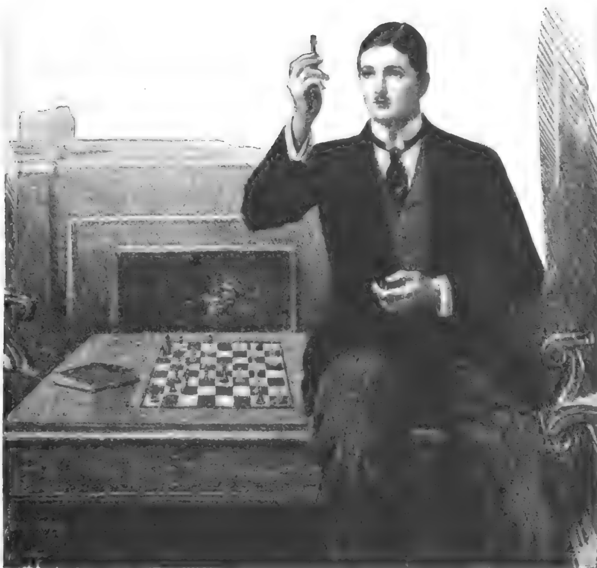
UP ONE OF THE PIECES TO EXAMINE IT."

Kenneth opened the chess-board. "Look at the stains on those chess pieces. They were not there when the game was finished. They were there, not so distinctly as now, about an hour ago. Precisely those pieces, and only those, are stained that Gornay touched in showing that Lord Churt might have won the game. If they are not stains of invisible ink, why should they grow more distinct? If they are invisible ink, how did it get there, unless from Gornay's guilty fingers?"