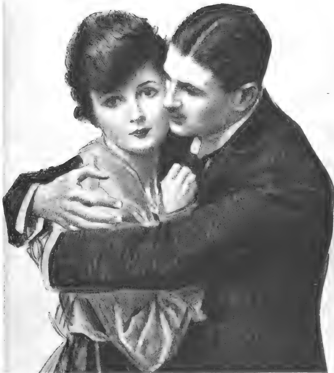
"KENNETH CONTRIVED, BEFORE ENTERING THE DRAWING-ROOM, TO INTERCEPT NORAH FOR AN EXCHANGE OF GREETINGS IN PRIVATE."

the eyes of the others. But, in his care for this, a thin bit of paper fluttered from the fold of the letter to the carpet, and all eyes instinctively followed it. It was a Bank of England note for a thousand pounds.