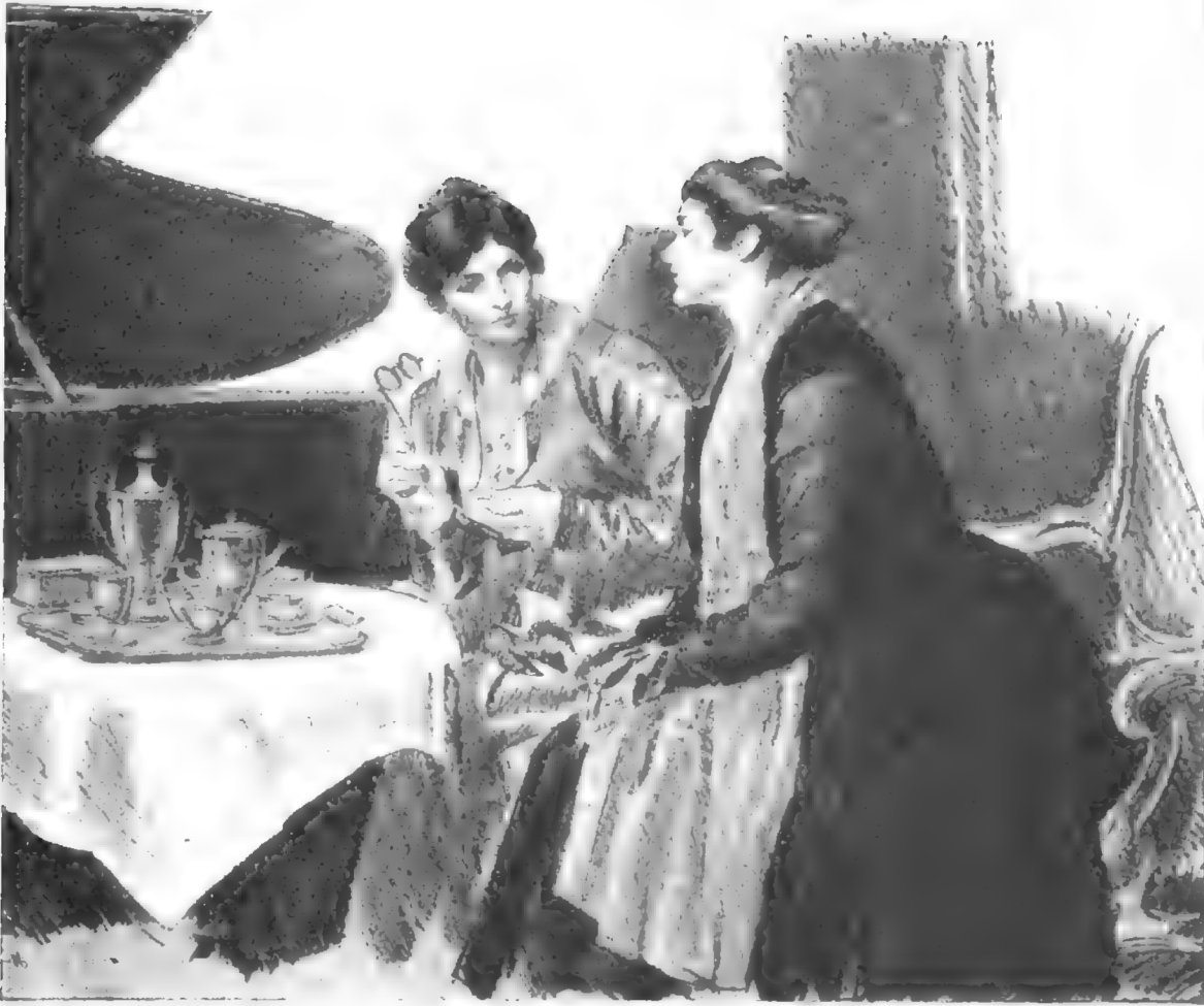
I PUT INTO THE RED CROSS ENVELOPE THIS AFTERNOON AS MY CHRISTMAS GIFT."

was cruel luck, he reflected, that the unfortunate postscript should be capable of misconstruction. He had counted on Norah's making a triumphant conquest of the Churt household, and it was exceedingly galling to find her, instead, exposed to an odious suspicion. Aunt Blaxter's demeanour was all the more maddening that he could think of no means to prove its unreasonableness. He looked gratefully at Lady Churt, as her gentle voice gave the discussion a fresh turn. "How long has Mr. Gornay been with us?" she asked her husband.